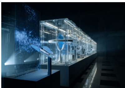
Festo Incredible Machine_dark